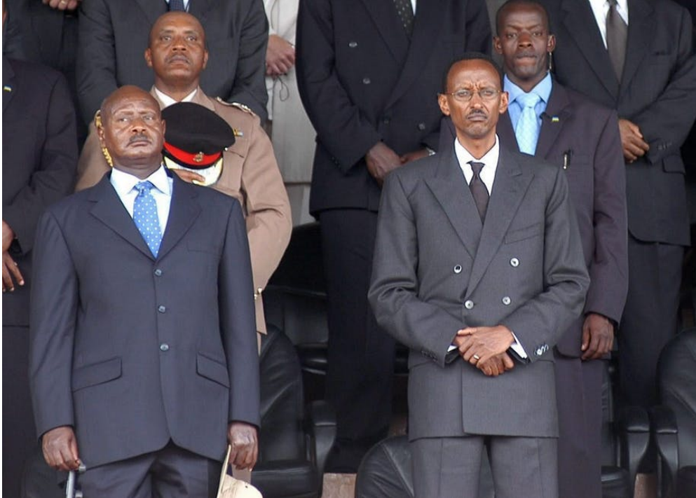
Presidents Paul Kagame (right) and Yoweri Museveni observe a minute of silence during a genocide memorial.