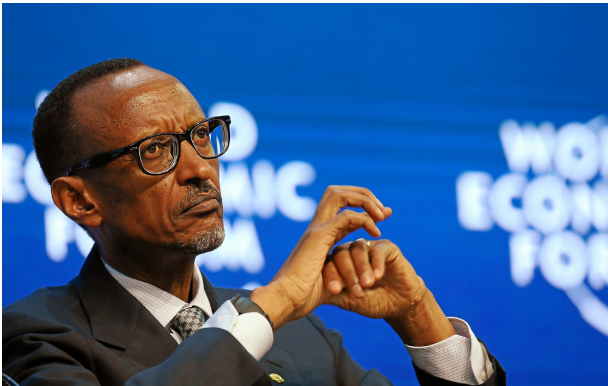
Rwanda’s President Paul Kagame.

The way President Kagame openly reprimands senior officials, who take it lying down, offers insights into the workings of Rwanda’s state.